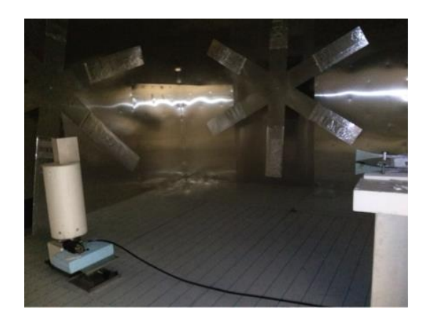
Fig. 2. Particular of the inner IUN RC with the flat S1 and S2 stirrers, the antennas in pseudo-monostatic configuration and with the dihedral corner reflector on the Microcontrole ITL 09 rotating table.

good agreement between the two curves witnesses that the RC can be used as alternative test facility to the traditional AC measurement procedures for measuring the RCS of a dihedral corner. It must be noted that these backscattering measurements of dihedral corner within the IUN RC are only a first approach to the RCS measurements in a multipath environment such as the RC.