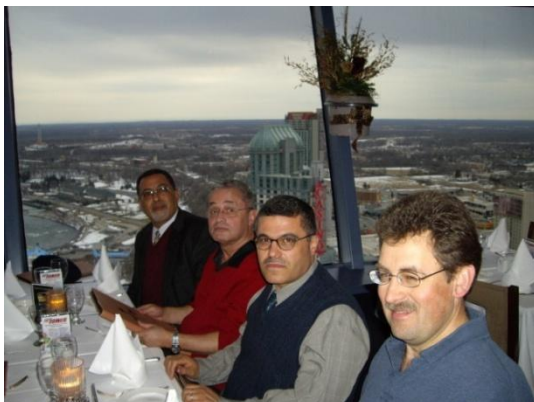
Message from the General Chairmen

On behalf of the ACES 2008 Organizing Committee, we welcome you all to the 2008 Applied Computational Electromagnetic