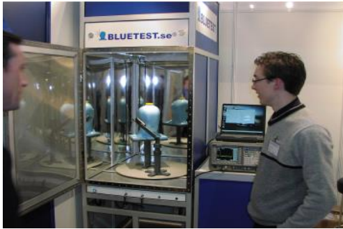
Fig. 1. Bluetest reverberation chamber.

positioners were acquire the data. Figure 2 [7] shows a Microwave Vision Group (MVG) multiprobe system to measure small antennas or terminals. None of both environments, free space created by anechoic chambers and isotropic created by reverberation chambers, represent really the real life situation. However, their advantage is that they can be reproduced easily.