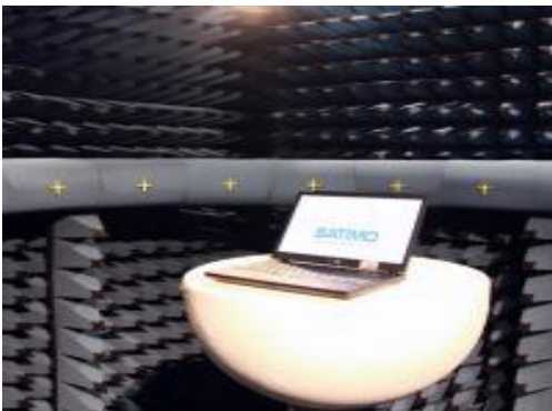
Fig. 2. Microwave Vision Group System to measure small antennas on terminals.

Multiprobe technology was proposed in [8] using the Modulated Scattering Measurement Technique (MST). This technique allows the identification of the signal coming from each antenna probe through a different orthogonal low frequency code. Therefore, a passive combiner network can be used, and each individual probe signal in amplitude and phase can be recovered. Of course, this technology can be used for the implementation of classical near field systems (spherical, cylindrical or planar) replacing one of the axes by a multiprobe system. The main advantage of these systems is the reduction of time, since only one dimension scan is required.