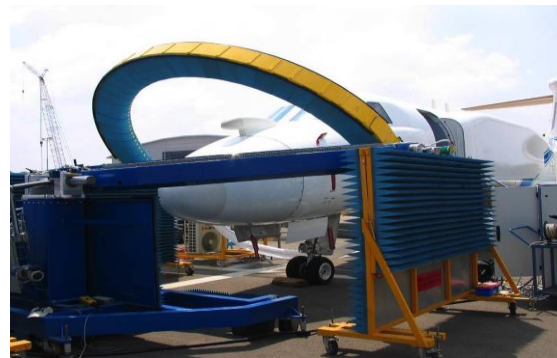
Fig. 3. Microwave Vision Group StarBot system.

The last focus area is related to in-situ measurements. Figure 3 shows the multiprobe StarBot system designed by MVG for the measurement of on-board antennas in airplanes. Figure 4 shows the Portable Antenna Measurement System (PAMS) that takes the form of a gondola suspended from the existing cranes. Astrium GmbH has built it, with support from ESA's Advanced Research in the Telecommunication Systems (ARTES) programme [11]. In Fig. 4, PAMS is shown performing near-field probing along a tilted and planar-oriented scan surface. This solution, together post-processing tools, is very convenient for the measurement of satellite antennas. It is also remarkable the work of some researchers from Politecnico de Torino. They designed an antenna test system using a flying hexacopter equipped with RF transmitter and a telescopic dipole [12]. All these solutions simplify the measurement process, making it closer to the design laboratory or to the final placement of the antenna.